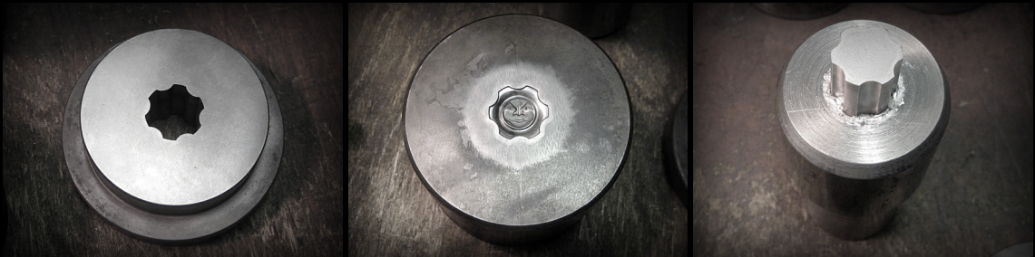
SARPANEVA KORONA CUFFLINKS